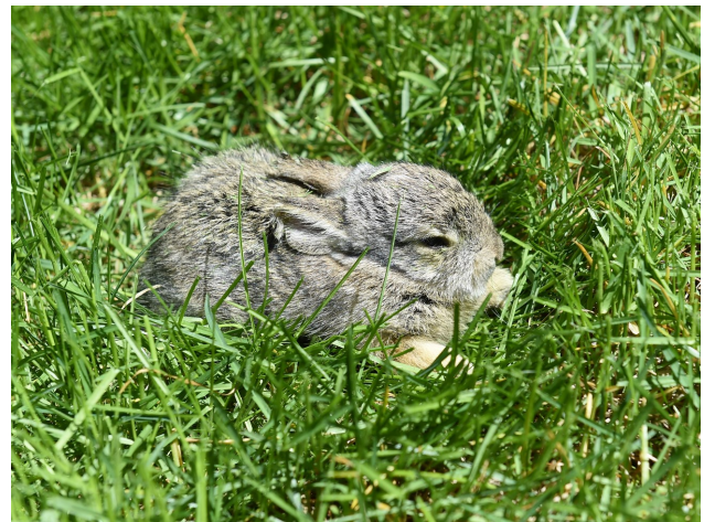
Spring is finally here!